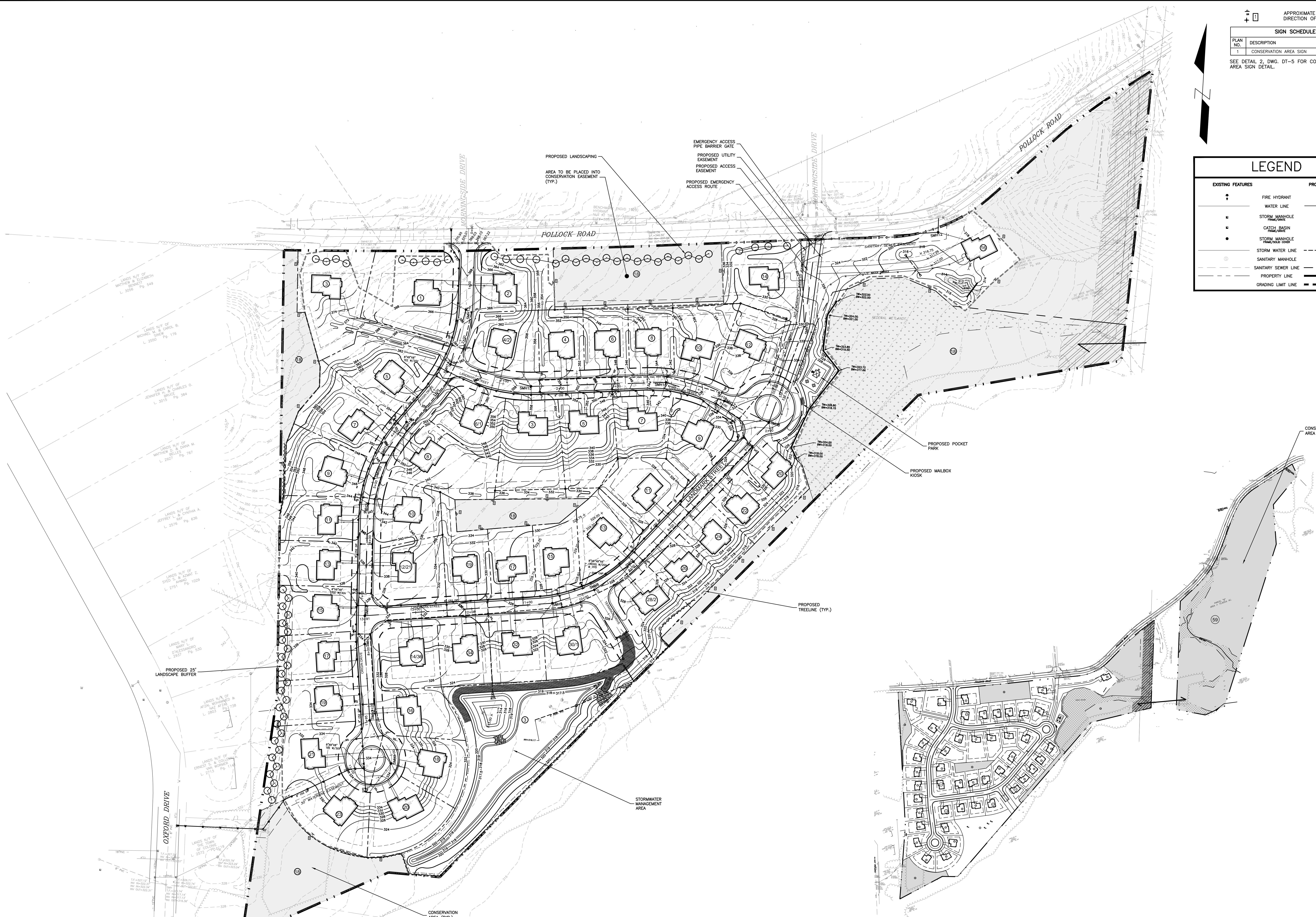
INDEX PLAN INCLUDING CONSERVATION AREA