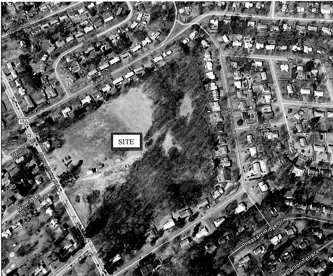
Aerial Photo of Existing Site

The existing site is a 20.54± acre parcel which will be the combination of two lots known as 499-507 Albany Shaker Road Tax Map Parcel Nos. 43.01-4-37 & 43.01-4-38, which is currently occupied by a dwelling, a farm stand and out buildings. The site is partially wooded and has two wetlands on it.